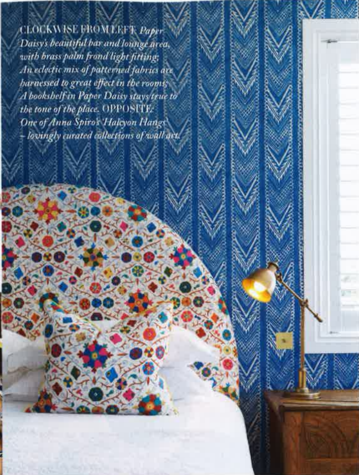
CLOCKWISE FROM LEFT Paper Daisy's beautiful bar and lounge area, with brass palm frond light fitting. An eclectic mix of patterned fabrics are harnessed to great effect in the rooms. A bookshelf in Paper Daisy stays true to the tone of the place. OPPOSITE, One of Anna Spiro's Halcyon Hangs – lovingly curated collections of wall art.